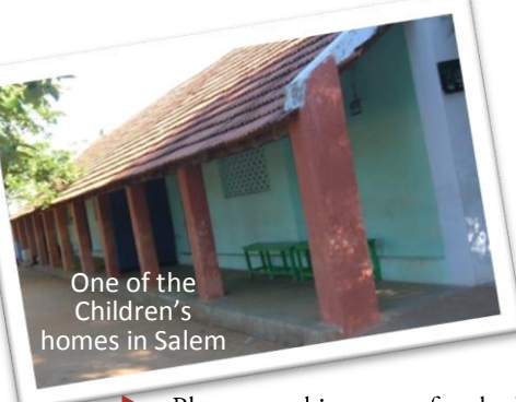
One of the Children's homes in Salem