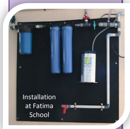
Installation at Fatima School

If you would like more details on the water system, log on to http://www.spantrust.org/manual.pdf