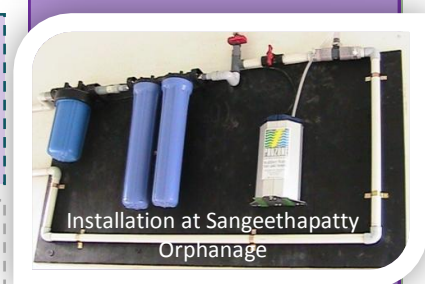
Installation at Sangeethapatty Orphanage